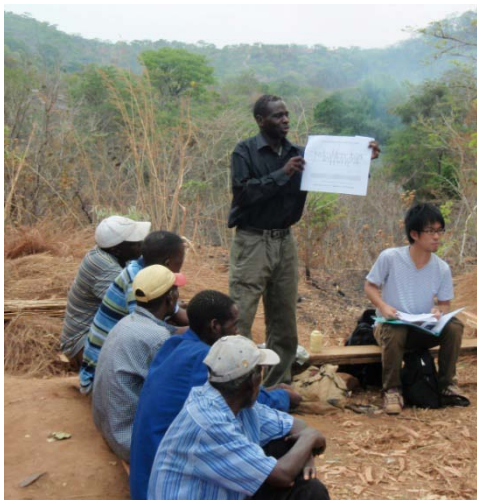
ZARI staff explaining weather index insurance (author on the right)

In November 2011, I took part in a three-week field survey in rural Zambia. The dry season had almost finished and the rainy season was on its way. Although they may have been busy with preparations for upcoming agricultural activities, the farmers were nevertheless willing to participate in our household survey.