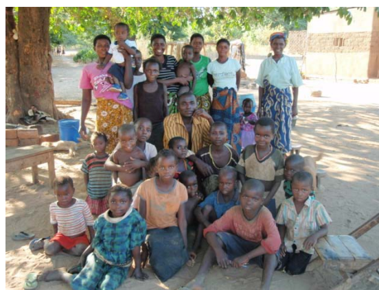
Members of a family that took part in the household survey

This was an auspicious start and the remainder of the survey also went well, so that eventually we had successfully collected data on 101 agricultural households during the three weeks. The final take-up rate for the insurance scheme was 93% and the average number of contracts purchased was 2.9. To be honest, I was quite surprised by this outcome. However, about 60% of respondents purchased only one or two contracts, which will be insufficient to fully cover potential income losses due to weather shocks. Therefore, their main reason for purchasing insurance may have been not to disappoint us. Nevertheless, more than 30% of all respondents bought four or more contracts. A household that has purchased four contracts will receive K100,000 in the case of drought or heavy rain. Even if food prices increase due to bad weather, this will be enough to purchase a 50kg bag of maize, the staple food in Zambia, which will sustain an average family for a month.