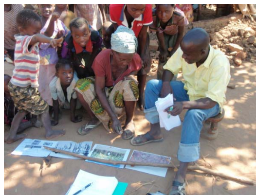
Locals talking about their expectations for total rainfall in the coming rainy season

The design of our insurance is very simple. If total rainfall recorded at the nearest Zambia Meteorological Department weather station is above 1,000mm (i.e., heavy rain) or below 600mm (i.e., drought) in the coming rainy season (November 2011-April 2012), the insuree will receive a payout in May 2012. The price of each insurance contract is K5,000 (approximately US$1) and, because of budget constraints, the maximum number of contracts each farmer was allowed to purchase was set to 20. To be actuarially fair, the premium rate was set at 20%, meaning that if a person pays K10,000 in November 2011 and if the total rainfall during the rainy season turns out to be above 1,000mm or below 600mm, he or she will receive K50,000 in May 2012.