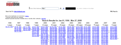
Figure 1: The Wayback Machine: http://www.archive.org/index.php

businesses can also be created by delving into the repository of web pages on the Wayback Machine (see Figure 1 for an example of the web pages for Citibank). This archive takes snapshots of the web every two months and stores them in the manner shown, providing a rich archive of hundreds of billions of web pages. Individual as well as business behavior can be studied using this archive. Indeed, major NSF grants, such as the Cornell Cybertools award 5 , have funded the study of social and information networks using these very large semi structured